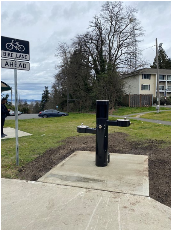
OS6. Drinking water fountains